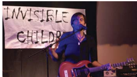
Raising awareness for Uganda’s invisible children.

Hearing of the plight of Uganda’s forgotten children, our entire junior high sponsored our first Christian Rock Concert, selling cookies, bracelets and T-shirts toward their pledge of $10,000 this school year! Through Invisible Children’s Schools for Schools program, they adopted a school in Uganda and have raised over $6,000, surpassing USC in funds raised for this cause!